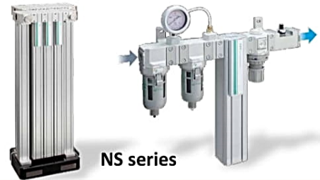
NS series Nitrogen separator