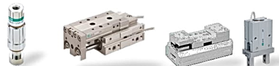
FBU2 Slider cylinder Hand & chuck