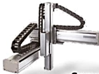
Servo motor driven series